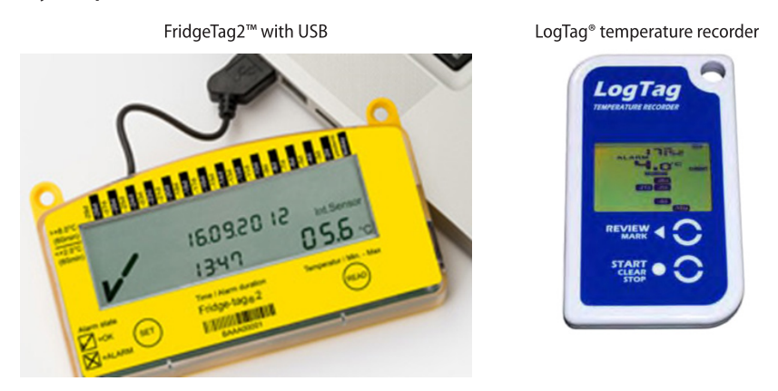
Figure 1 R30-day temperature recorders

An SMS-enabled device can offer out-of-hours assurance because staff can receive alarm alerts on their mobile phones. A USB-enabled device allows temperature records to be downloaded and these records can then be reported to supervisory staff.